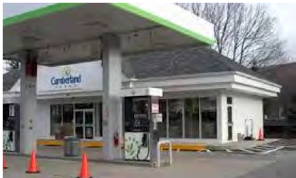
Cumberland Farms features a bakery center, coffee bar and state-of-the-art hot dog ovens.

Unsure of what to eat, I decided to consult a gaggle of glossy eyed youths for recommendations. With arms full of bags of Funyuns, they greeted me with a “suh dude,” and instructed me to try “the mac and cheese bites, they’re savage.” I followed their advice and purchased “mac and cheese bites,” a milkshake, a bag of Doritos and a couple hotdogs. The waiter informed me my total was $3.16. Apparently the price point of Cumbies is a major draw for its patrons. I attempted to tip but was told, “What do you mean? You can’t tip here.” I guess I can’t keep up with all these new age trends, because where I am from, you tip for service at a restaurant. But I digress. I consumed my meal in the parking lot, and it was delicious. If you are a looking for a new style of restaurant, I highly recommend Cumbies. While they may do things differently, it certainly is 🍆