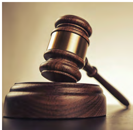
After two years of intense litigation moving all the way to the United States Supreme Court, a verdict on the fate of the Pacer test has been declared.

In late March, the Fitnessgram Progressive Aerobic Cardiovascular Endurance Run (Pacer) test was banned for violating the Eighth Amendment. The test, first instituted in the 1950s in Communist Russia, calculates maximum aerobic endurance by having students repeatedly run an interval in gradually decreasing times until they trip, faint, or lose the ability to breathe due to excessive crying. Finally removed from its place in gym curriculum, this method of testing has been deemed cruel and unusual punishment. In the finale of a two year long court case, Chief Justice Judge Judy dropped the gavel on the test, removing it from schools across the country.