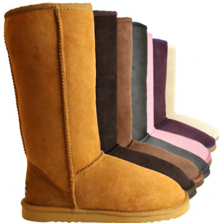
A colorful spectrum of Ugg boots can be seen walking the halls of Mt. Greylock.

It’s a well known fact that Mt. Greylock embodies the ideal of gender, racial, cultural, physical, and political diversity, so three years ago the administration proposed a day of celebration for the multicultural group. In anticipation of the third annual Mt. Greylock Diversity Day, we reached out to students to get their opinions on how diversity at Greylock has impacted them.