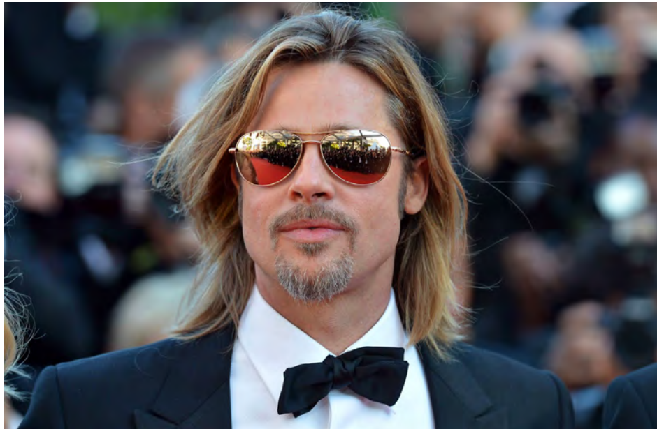
A model exhibits the subtle command of the Sulti Bow, the garment that caused the devastating senior class conflict.